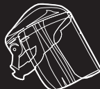
EYE AND FACE PROTECTION