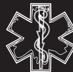
FIRST AID PRODUCTS