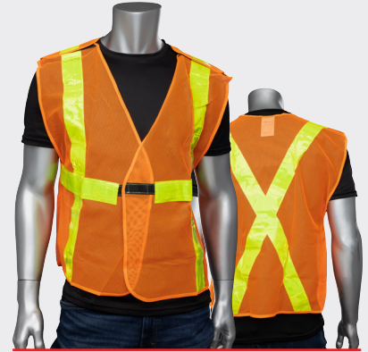
DAYTIME VEST TSVOXT11 L-XL