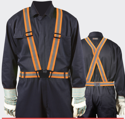
TWO TONE SASH BELT TSHG32 L