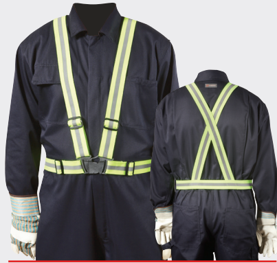
TWO TONE SASH BELT TSHG33 L