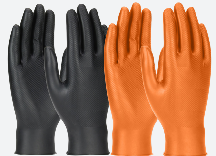
PIP® Grippaz® Skins GP67246 (Black) // GP67256 (Orange) sized S - 2XL