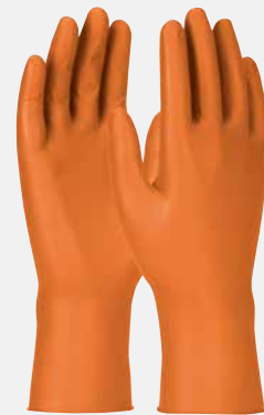
PIP® Grippaz® Engage sized S - 3XL