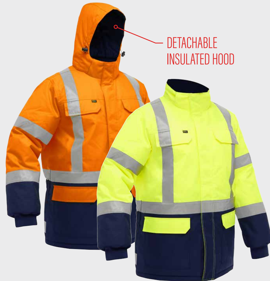
DETACHABLE INSULATED HOOD