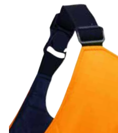
ADJUSTABLE ELASTIC SHOULDER STRAP