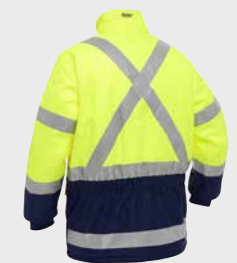
REFLECTIVE "X" TAPED PATTERN