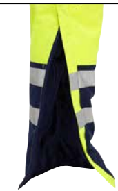
LONG SIDE LEG VENT