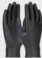
Grippaz® Skins GP67246, 6 mil