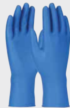
Grippaz® Food Plus GP67308, 8 mil

EXTENDED USE GLOVES OFFER THE DEXTERITY AND COMFORT OF A LIGHT-DUTY GLOVE AND THE DURABILITY NEEDED FOR A WIDE VARIETY OF INDUSTRIAL APPLICATIONS