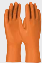
Grippaz® Engage GP67307, 7 mil