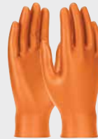
Grippaz® Skins GP67256, 6 mil