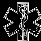
FIRST AID PRODUCTS