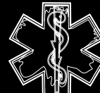
First Aid Products